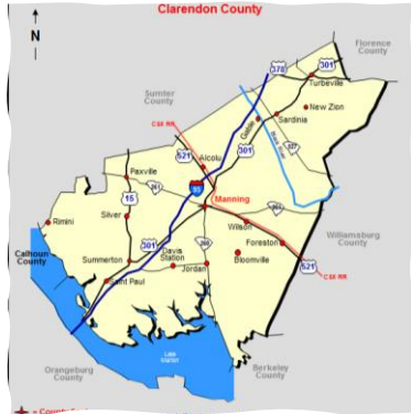
Consolidation of Clarendon School Districts 1 and 3