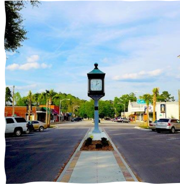
Consolidation of Hampton School Districts 1 and 2