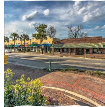
Jasper County Board Elections