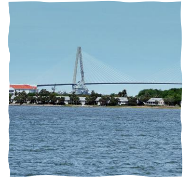
Charleston County School Board Seats At-large to Single-member